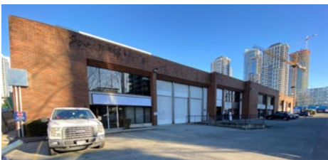
DAWSON BURNABY, BC