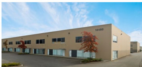
14480 KNOX WAY, RICHMOND, BC