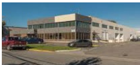
14251 BURROWS ROAD RICHMOND, BC