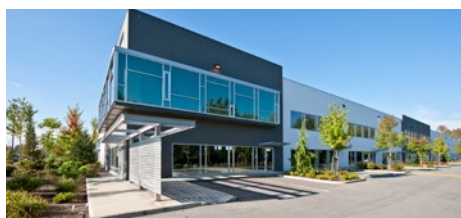
27353 58TH CRESCENT LANGLEY, BC