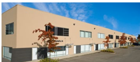
14488 KNOX WAY RICHMOND, BC