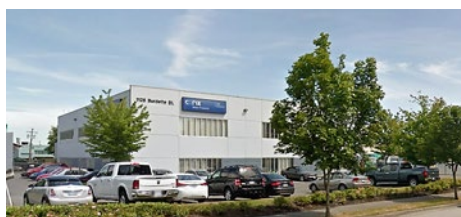
1128 BURDETTE STREET RICHMOND, BC