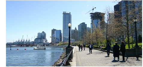
THE VANCOUVER SEAWALL A stunning coastal pathway spanning 28 kilometers, offering breathtaking views and recreational activities along the waterfront.