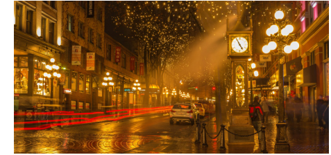
HISTORIC GASTOWN Known for its charming cobblestone streets and Victoria architecture, Gastown offers a unique blend of old-world charm and contemporary flair, with trendy boutiques, eclectic shops, and a diverse culinary scene.