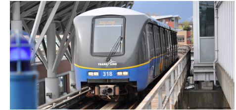
CANADA LINE SKYTRAIN STATION Located just a short 5-minute walk from the Canada Line Skytrain Station, Richards & Pender offers convenient access for effortless travel across the city and beyond.