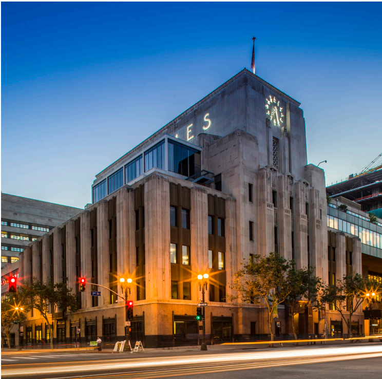
LOS ANGELES, CA - THE LOS ANGELES TIMES CAMPUS 202 W. 1ST STREET