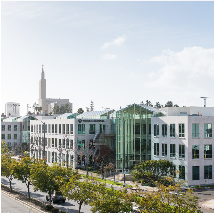
LOS ANGELES, CA - ATRIA WEST 10535 SANTA MONICA BLVD