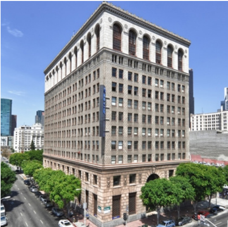
LOS ANGELES, CA - THE COAST SAVINGS BUILDING 315 W 9TH STREET

CHRIS SINFIELD, TOM SHEETS, QUINT CARROLL CUSHMAN & WAKEFIELD 310.525.1922