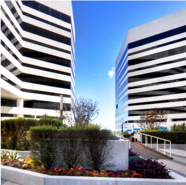
MANHATTAN BEACH, CA - MANHATTAN BEACH TOWERS 1230 ROSECRANS AVENUE